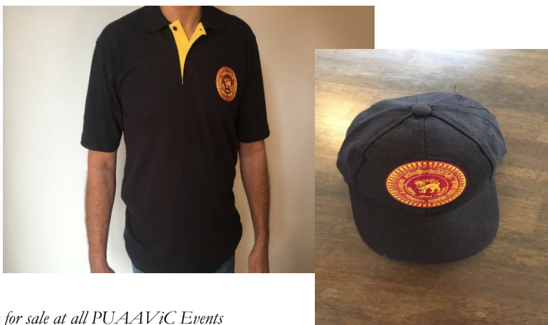
Available for sale at all PUAAViC Events

PUAAViC T-shirts and caps embroidered with the original University of Peradeniya logo are now available to purchase at future PUAAViC events for AU$ 20.00 and 10.00 respectively.